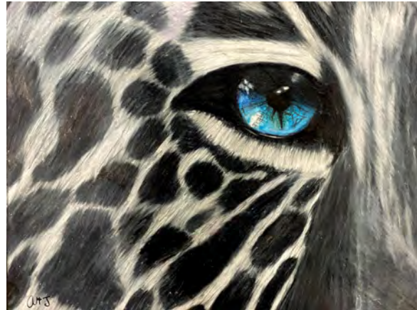
SnowLeopard, Abigail, Sandy Creek

We are proud to be the host of this exciting show that celebrates the talent of students in our area. We invite the nine school districts, as well as homeschool and independent students in grades 7 - 12 to submit their original art to the show. You can find the details and entry forms on our website. This year the plan is to give out over $1,500 in cash prizes in at least six different categories: drawing, painting, Ceramic/sculpture, Printmaking/mixed media, photography and digital design as well as a $100 best of show. We are grateful that Deaton's Ace and Agway of Pulaski will continue to be a major sponsor for this show. We are still looking to other local businesses throughout the county to help us make this show extra special for the students. It's a wonderful way to boost a student's confidence and nurture lifelong skills. If you are interested in sponsoring or know someone who might want to be a sponsor, please let us know.