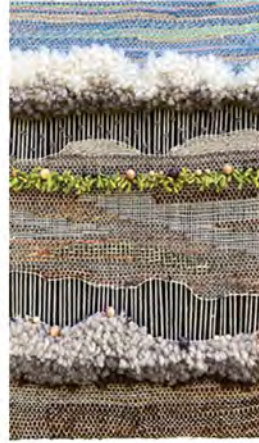
Landscape, Barbara Golden