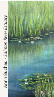
Ann Buchau - Salmon River Estuary