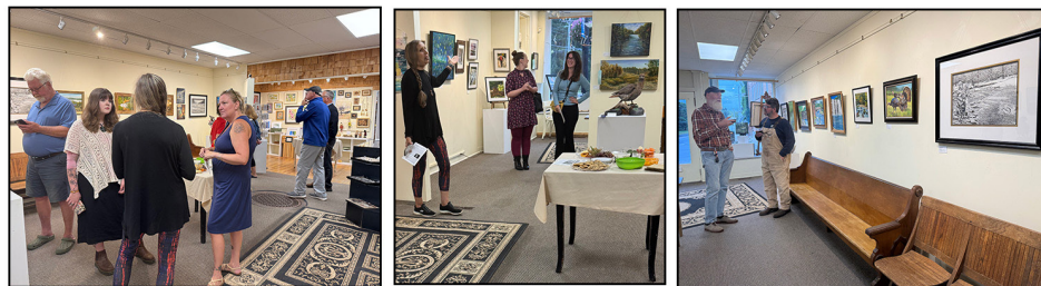
Scenes from our opening reception and awards ceremony.